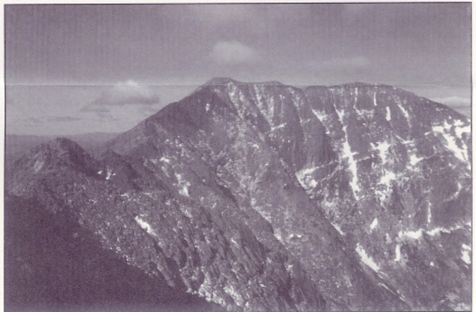
Late Spring, and snow and ice still fill the gullies on Baxter Peak. More shaded spots in South Basin may harbor the remnants of winter well into the warm days of summer.