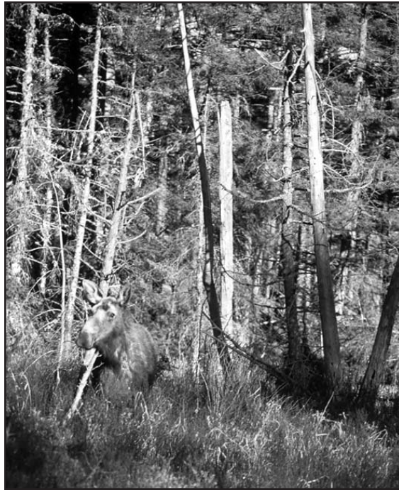
What's that? The Baxter moose in this picture blended so well into the background she was almost missed by the photographer.

The day before the storm, we took a hike and ran into a kindred spirit on the trail. He had his camera in hand and was looking for a moose to photograph. He said he hadn't seen one yet so we chatted a bit on the trail and then went off in different directions. Soon after leaving him, we saw a cow and her calf at Elbow Pond. Too bad he missed this, I thought, as we watched the cow plucking her dinner from the bottom of the pond.