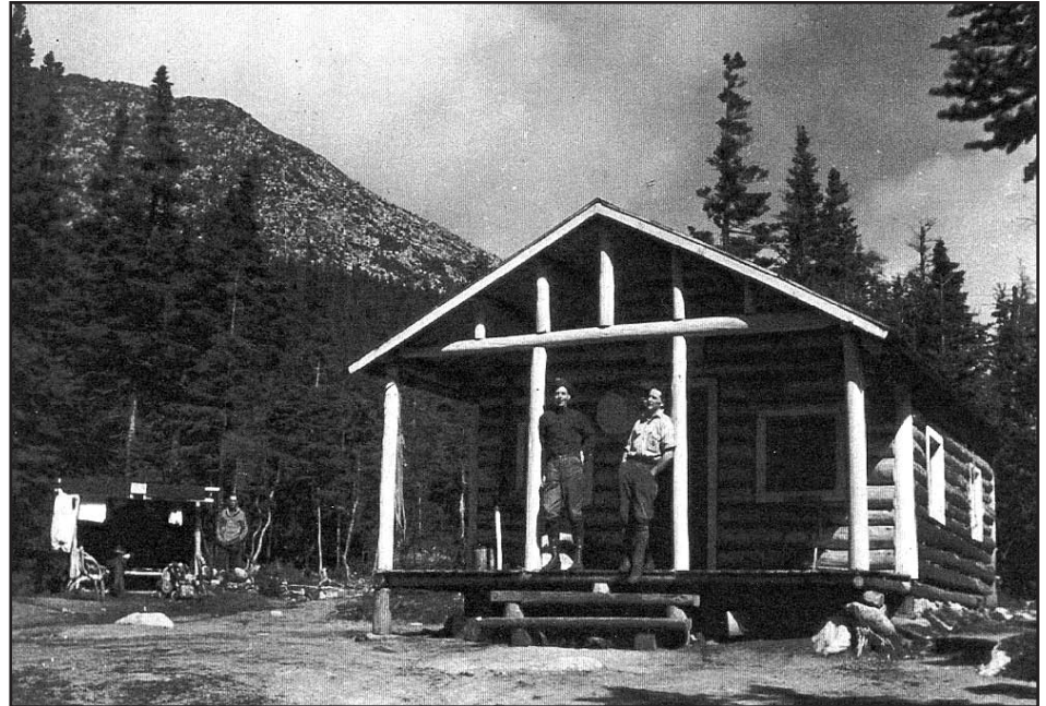
Early Days. Leroy Dudley, guide and Katahdin legend, left, relaxes with a friend on the porch of the Katahdin Game Preserve warden's camp at Chimney Pond. The photo was taken in the late 1920's before the area became Baxter State Park and is available on a post card for new members of the Friends. (See page 4.)

But there is much more work to be done. The press frequently inquires about our stands on issues, for instance and most recently, the removal and replacement of the cabins at Daicy Pond. It is important for us to be able to weigh in on such critical matters. And we must take other measures to strengthen Friends; e.g., improve our (Continued on page 4)