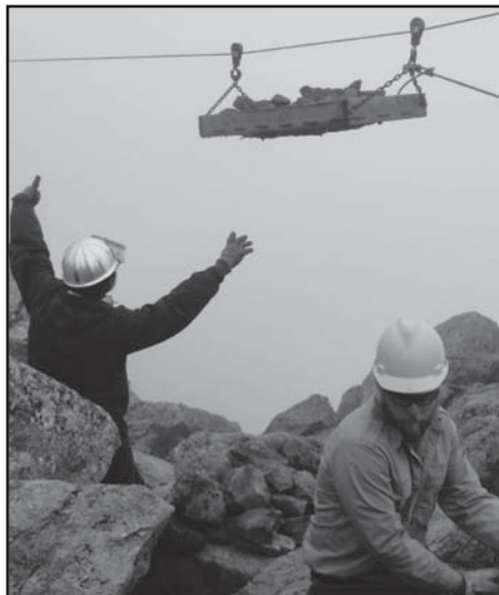
Quarrying rock to stabilize trails above the tee line is time-consuming and technical work. The Park's trail crews "move mountains" during the course of the summer.

As we move toward the close of the camping season on Saturday, October 15, we are preparing for our last major project of the year – the completion of the restructuring work at the Foster Field Group Camping area. This last phase will include the realignment of the Park Tote Road to place the Group Area on the east side of the Tote Road. We hope to complete this work sometime between October 18 and 28, and the work will likely involve the closure of the Tote Road at this location for one or two days. When the work is completed, we believe this popular group campground will be safer, quieter, less dusty, and more enjoyable to Park campers. After this work is completed, we will be dusting off the cross-country skis and getting ready for snow!