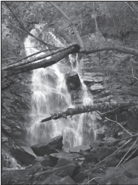
Hidden Falls at Middle Fowler may not be on the map.