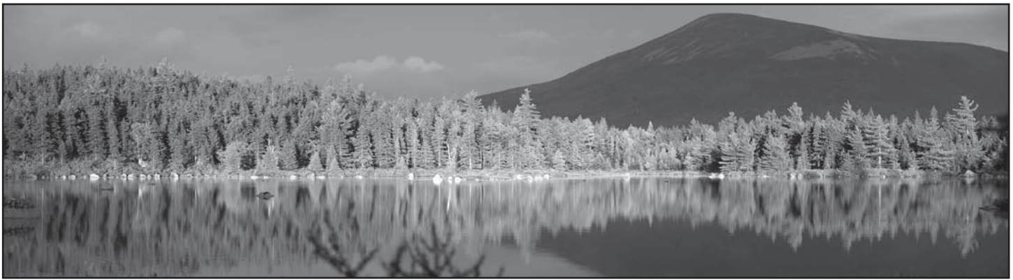
North Turner comes into view over Russell Pond as weather breaks, welcome sight during stretch of rainy days.