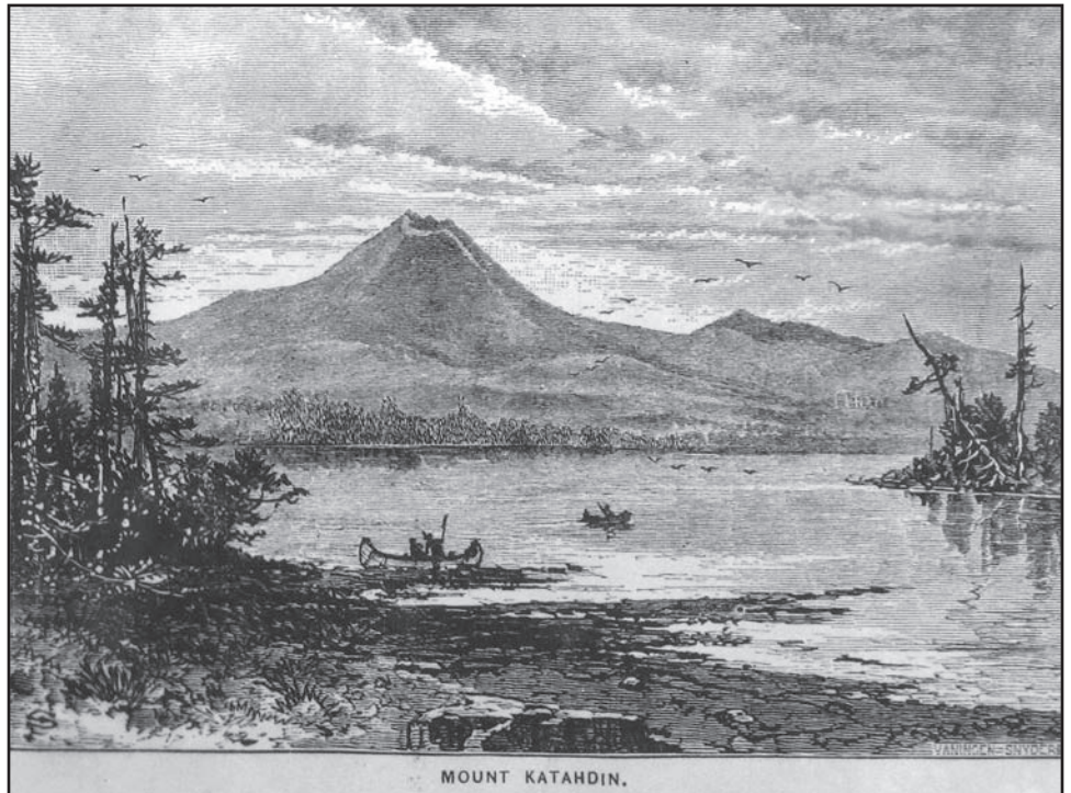
The original caption with this engraving reads: The highest mountains in the State are Mount Katahdin, 5200 feet; Mount Abraham, 3388 feet; Mount Blue, 2700 feet; Mars Hill, 2000 feet.