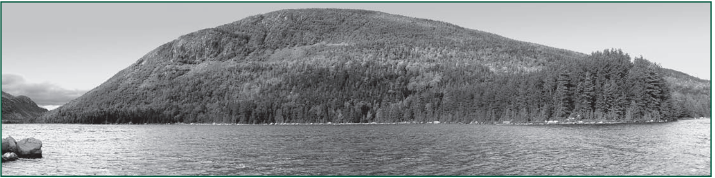
This view of South Pogy from Wassataquoik Lake shows the scree slope Neff refers to in the article below, a scramble up which affords one a fabulous view of the Wassataquoik valley.